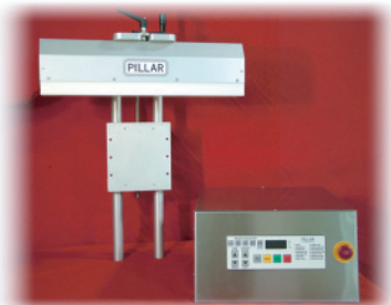
Unifoiler-C: Conveyor Mount Stationary System