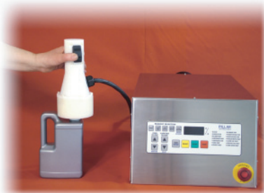
Unifoiler-H: Hand-held sealer

The Unifoiler™ outputs the highest level of performance in the industry today thanks to unsurpassed commitment to quality and engineering. Why waterless? Simple. Waterless systems are less than one-half the size of formerly popular water-cooled systems because we've eliminated filters, hoses, pumps, radiators, flow switches, water and most of all - the mess.