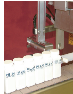
In-Feed Bottle Stop

For specifications, outline drawings or to request an on-line quote, please visit www.pillartech.com