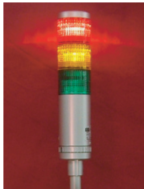
Deluxe Stacked Light