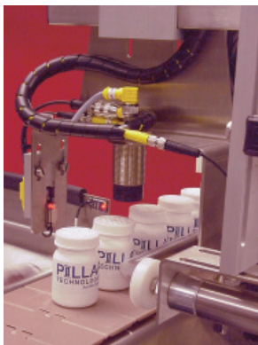
Detect & Reject