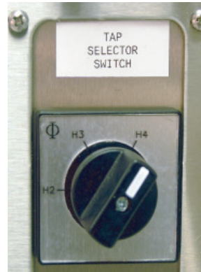
Tap Selector Switch