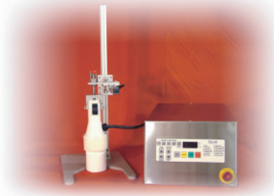
Unifoiler-H: Semi-automatic induction sealer with adjustable coil mount