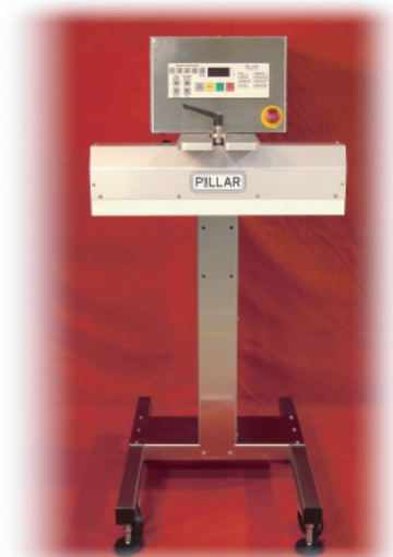
Unifoiler-U: Unitized portable sealer. This is the "work-horse" of the Unifoiler family.